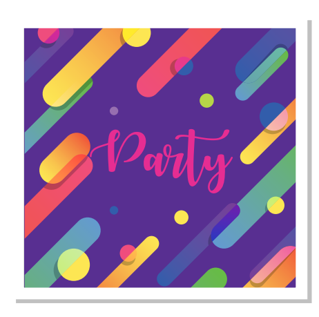
Pro9542E Five Colour Digital Printing (CMYK + White, CMYK over White in 1 pass)