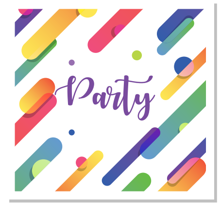
Pro9431E Four Colour Digital Printing (CMYK)