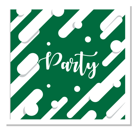
Pro9541E Five Colour Digital Printing (CMYK + Clear or CMYK + White)